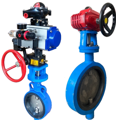
IS-BFV BUTTERFLY VALVE