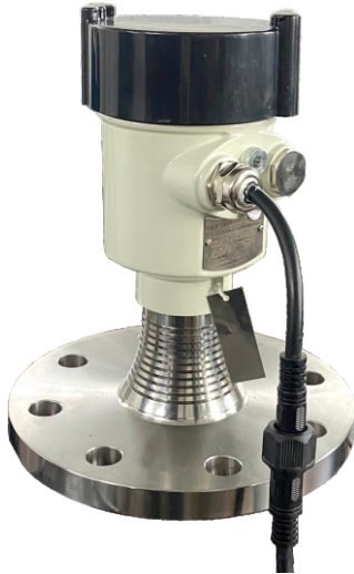
IS-RLT RADAR LEVEL TRANSMITTER