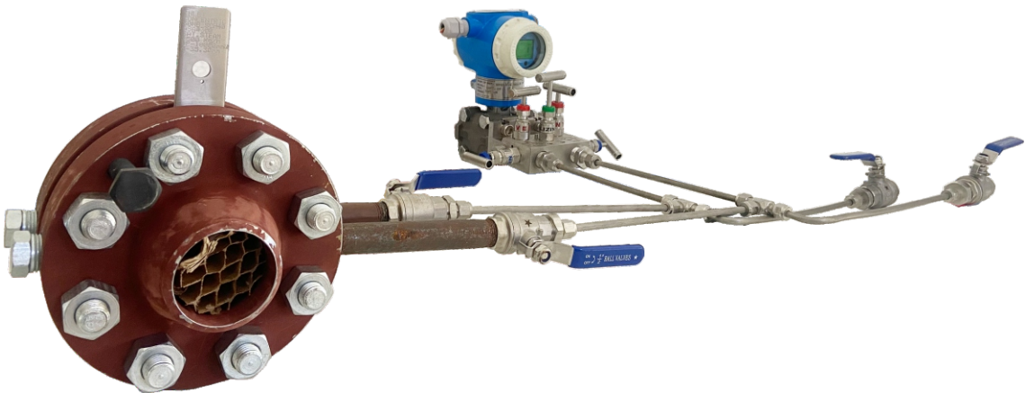
IS-SFM ORIFICE TYPE STEAM FLOW METER