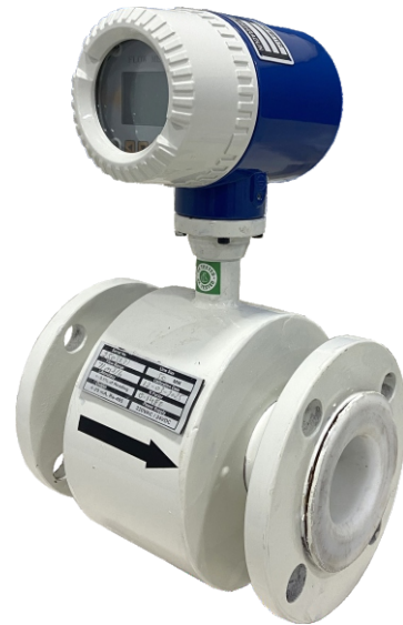
IS-MFM ELECTROMAGNETIC FLOW METER