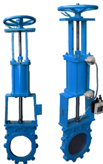
IS-GV GATE VALVE