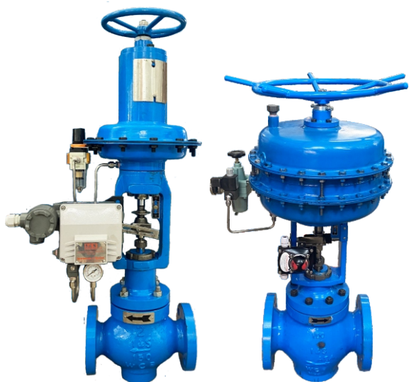
IS-GLV GLOBE CONTROL VALVE