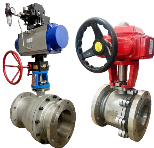
IS-VNBLV V-NOTCH BALL VALVE